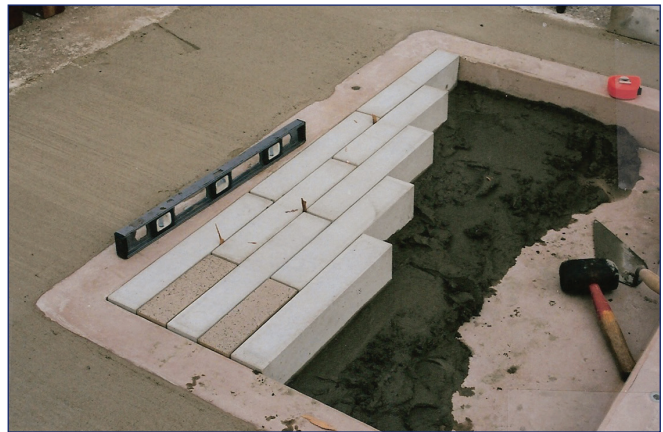
The precast concrete 27/8" x 177/8" x 4" Narrow Modular Pavers were set in a 1" mortar bed. Pavers were cut to fit to provide a staggered bond joint pattern.