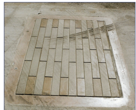
Skid marks on top of pavers show evidence of deliberate attempts to disturb installation. The mortar-set Narrow Modular Pavers held fast and were not dislodged by vehicular traffic.

The outcome of the full scale test program described herein has substantiated the satisfactory performance of a mortar-set, sand joint Narrow Modular Paver system installation when subjected to light vehicular traffic loads.